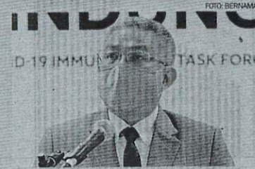
Dr Adham pada sidang akhbar di Putrajaya pada Isnin.

turut dilaporkan bagi tempoh sama dengan purata 64 kematian sehari.