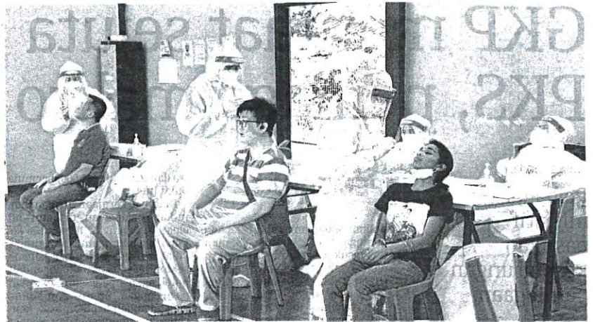
Putugas kesihatan melakukan ujian saringan COVID-19 percuma terhadap orang ramai yang dianjurkan kerajaan negeri Selangor di Dewan Majlis Perbandaran Klang Taman Klang Jaya, Klang, semalam.

"Peningkatan kematian ini dapat dilihat sejak sembilan minggu lalu iaitu sejak minggu epid 12,"