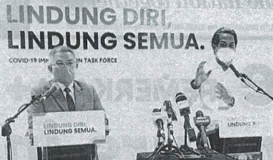
Take care of another: Khairy (right) and Dr Adham Baba holding a press conference on the immunisation programme.

About 30 mobile trucks will be used for this outreach programme where around 100 vaccinations can be done per mobile truck per day.