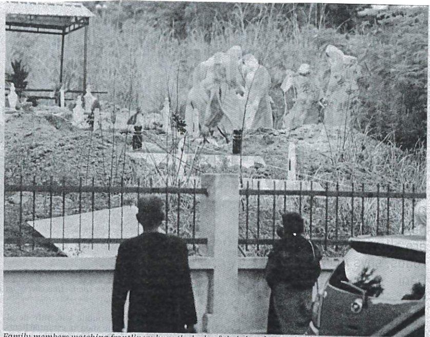
Family members watching frontliners bury the body of their loved one, who died of Covid-19, at the Setali Muslim Cemetery in Kuantan on May 2.