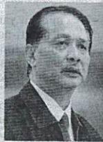
DR NOOR HISHAM

Menerusi catatan di Twitter, Dr Noor Hisham berkata, Selangor masih menyumbang kes